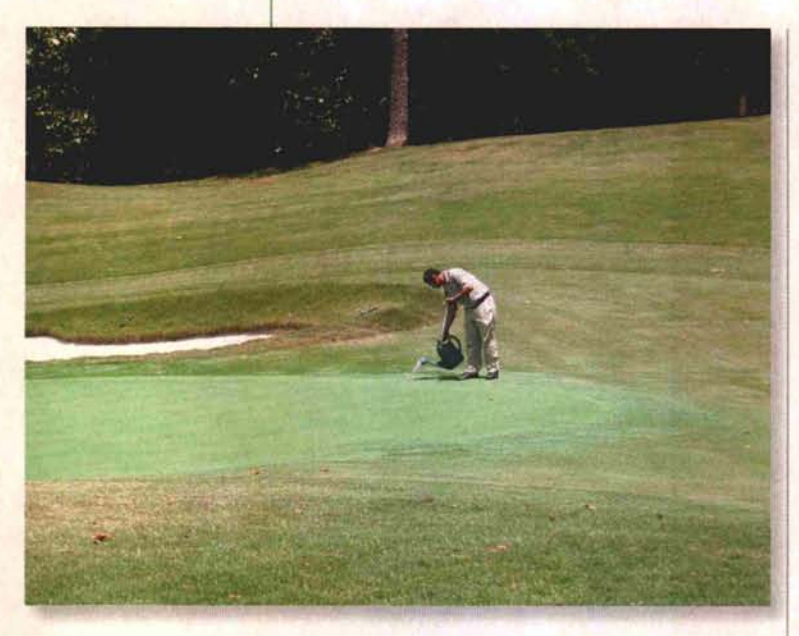
To reduce water usage but keep the greens alive, a probe is used to locate small dry spots, which are then watered using a watering can.

ronment. To illustrate, stakeholder considerations would entail evaluation of how a regulation for one environmental issue may induce another environmental problem. For example, removing stable turfgrass ground cover could result in soil erosion and sediment movement into surface waters.