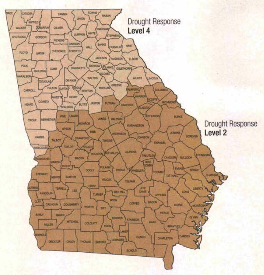
The level-four drought response in Georgia includes all of metropolitan Atlanta, Rome, Athens and Columbus.