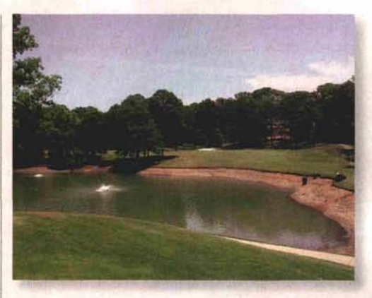
On Sept. 28, 2007, the director of the Georgia Environmental Protection Division declared a level-four drought response across the northern third of Georgia, prohibiting most types of outdoor residential water use. An irrigation pond at Atlanta CC is pictured.

To build on this foundation, the Georgia Allied Golf Council was formed with leadership from the GGCSA. The GAGC, which includes the allied state associations of club managers, club owners, golfers and golf course pros, is actively working to foster a statewide BMPs approach as the best water management plan for the state (Table 3). The GAGC's approach will be similar to that used by the GGCSA in 2004, which resulted in acceptance of site-specific BMPs. Namely, the GAGC will formulate and bring to the state political and regulatory entities a BMPs-based water-use efficiency and conservation plan encompassing the