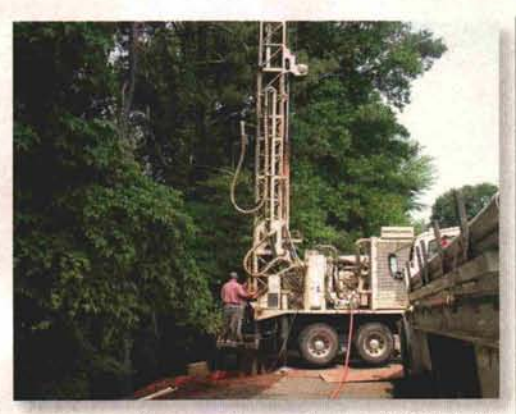
Workers repair a groundwater well at Atlanta CC.

another. For golf courses, this ordinarily means reducing irrigation on most areas, but maintaining greens even when the highest restriction level is in effect unless that level closes down the major water users on a long-term basis.