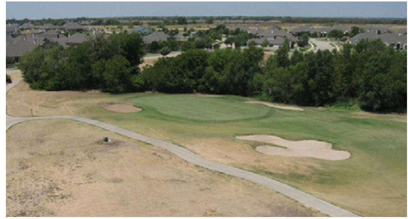
Putting green complexes typically encompass 4 to 6 percent of the total golf course area, and continuing to irrigate these areas helps to maintain acceptable playing quality while using relatively little water. (Photo by Jim Moore, USGA.)

©2013 by United States Golf Association. All rights reserved. Please see Policies for the Reuse of USGA Green Section Publications. Subscribe to the USGA Green Section Record.