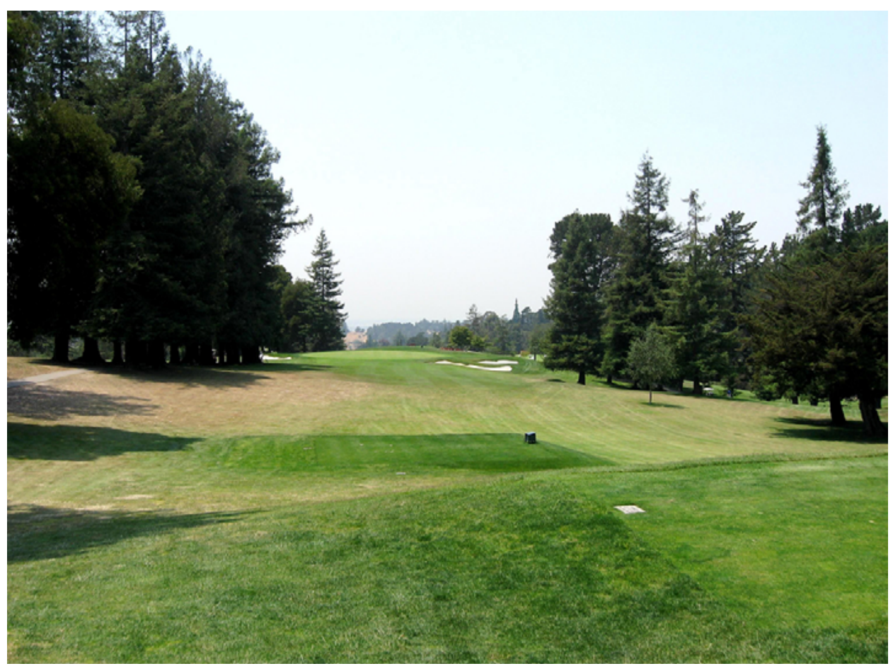
During a drought emergency, putting green complexes and teeing grounds typically receive the highest priority for irrigation, while the rough receives the lowest priority.