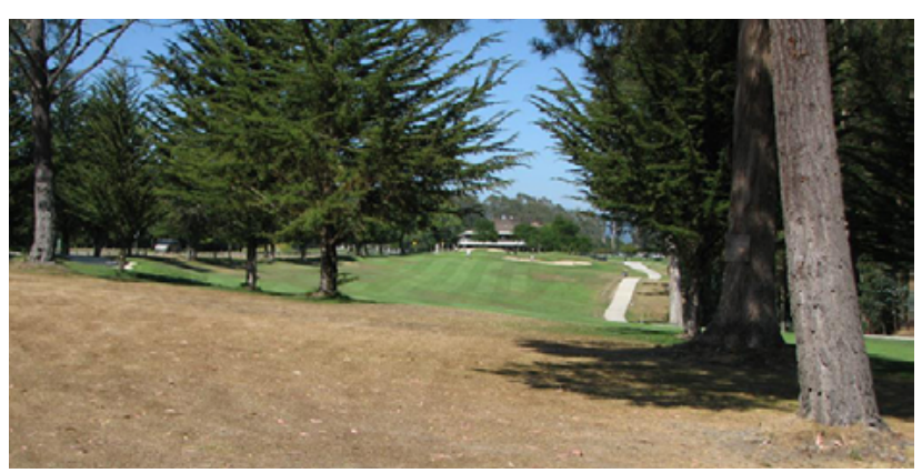
During a drought emergency, the greatest amount of water saving will be achieved by reducing water applications on larger areas of the property, such as the rough.