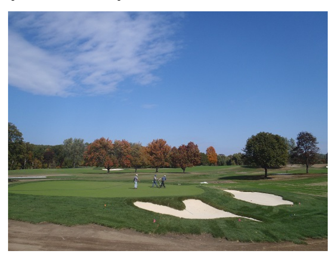
Figure 3. Nutrients applied to a new green complex.