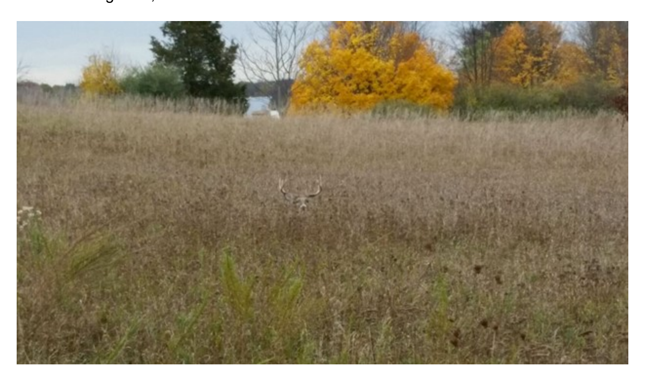
Figure 6. Deer peering above a well maintained grass field and wildlife corridor at Elcona Country Club, Bristol, IN.