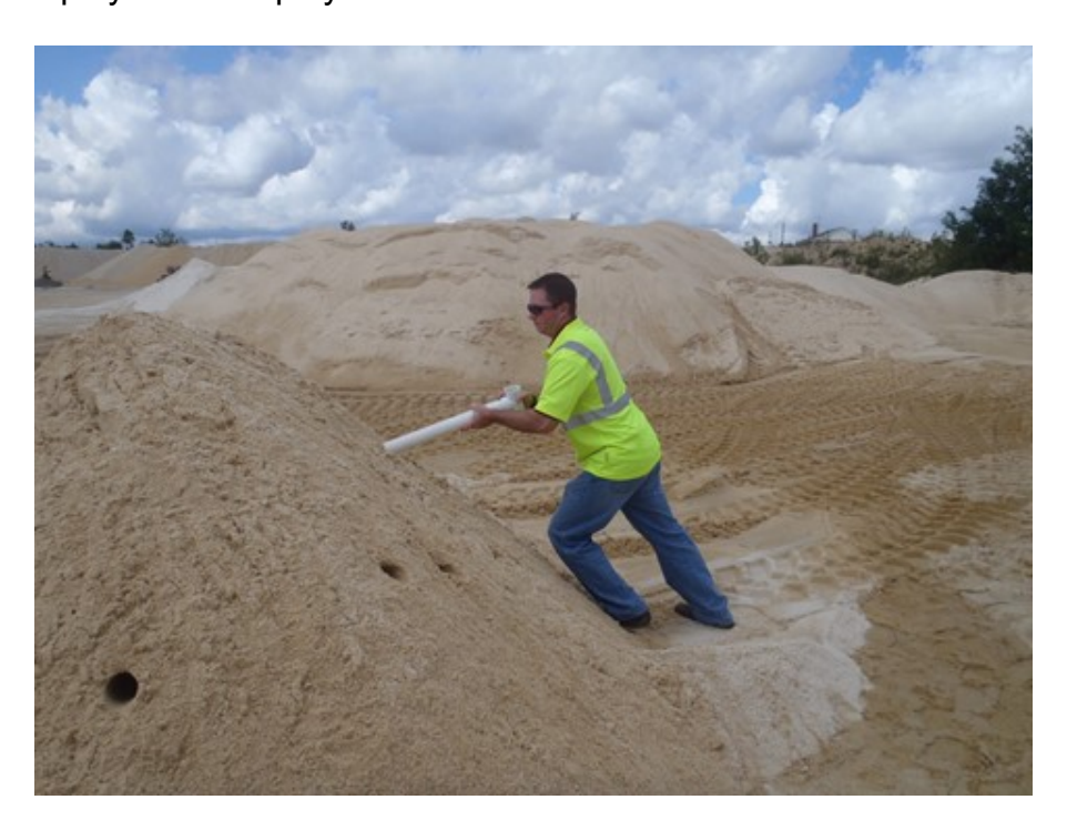
Figure 1. Collecting sand samples for particle analysis.