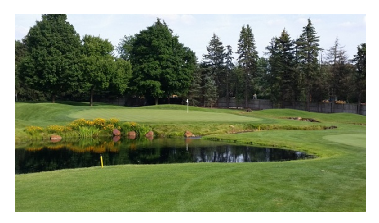
Figure 9. Pond at Elcona Country Club complete with 50% buffer "no maintenance" zone, pollinator plantings, and creek that serves as an aeration device.