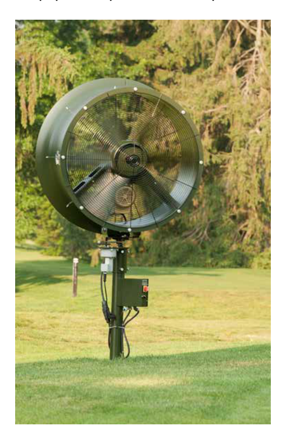
Figure 21. Fan used to cool low cut turfgrass surfaces.