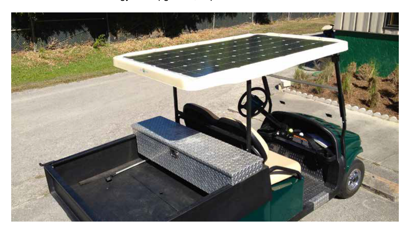
Figure 23. Use of solar panels to power a utility cart.