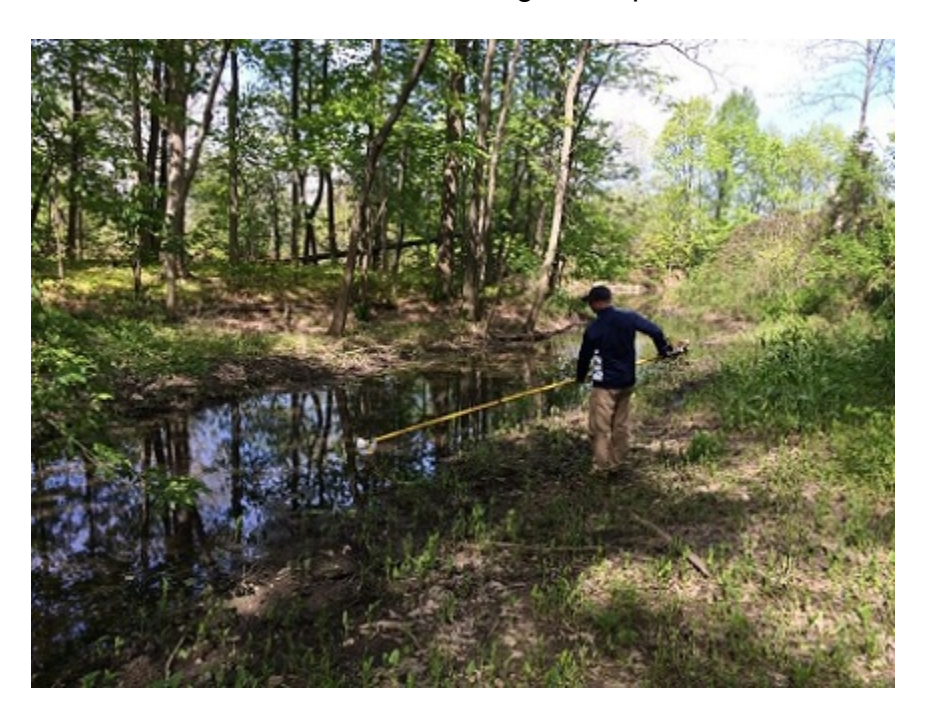
Figure 12. Collecting samples of a water body.