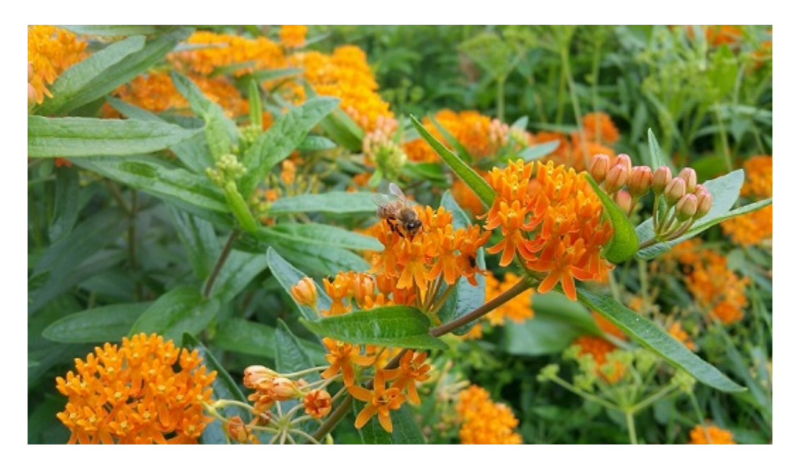
Figure 17. A bee on butterfly weed.