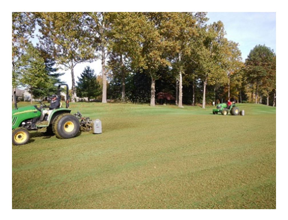
Figure 16. Verticutting operation on a fairway.