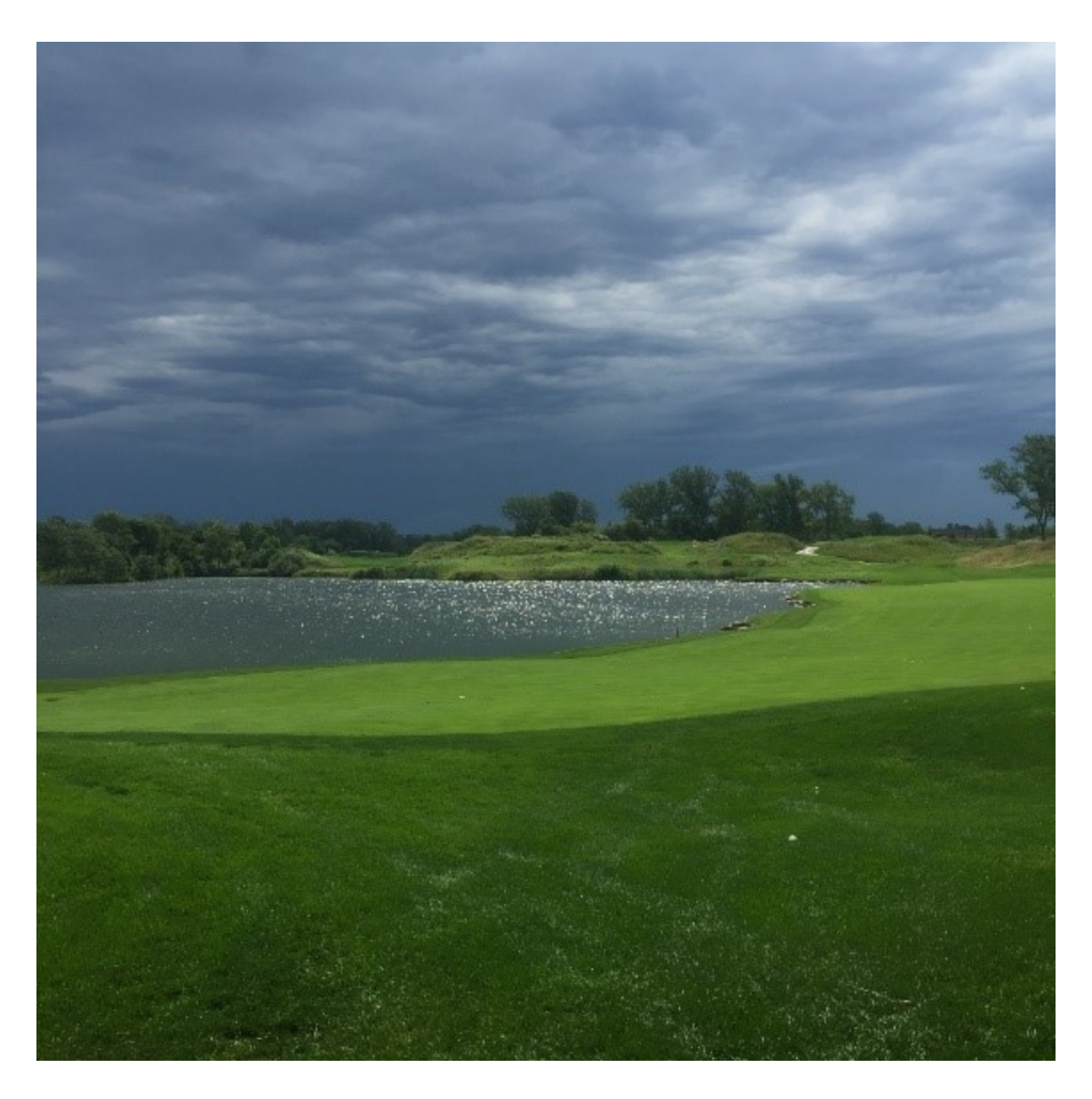
Figure 4. Pond at Victoria National Golf Club.