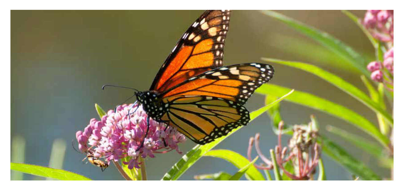
Figure 19. Monarch butterfly in a landscape.