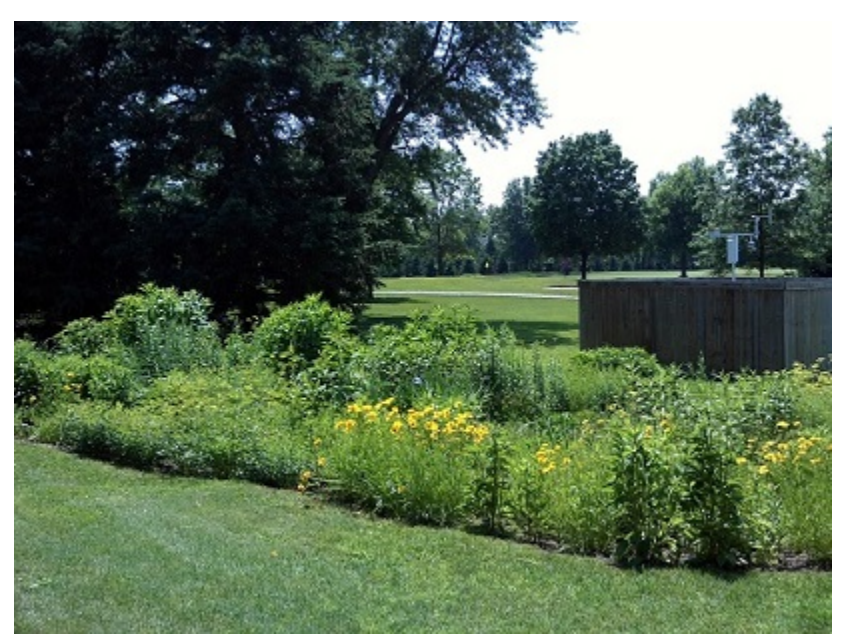
Figure 8. On-site weather station at Elcona Country Club.