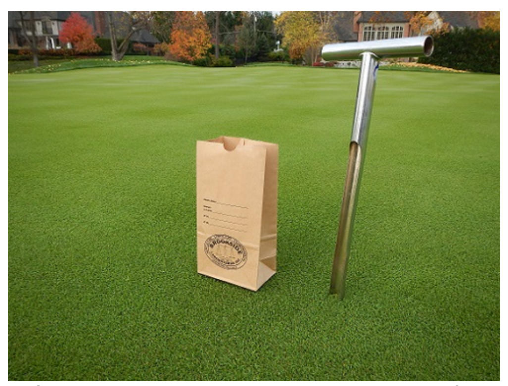
Figure 13. Collecting soil samples on a putting green.