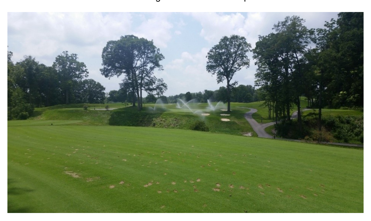
Figure 7. Green complex irrigation running on the Ackerman-Allen course at Purdue University.