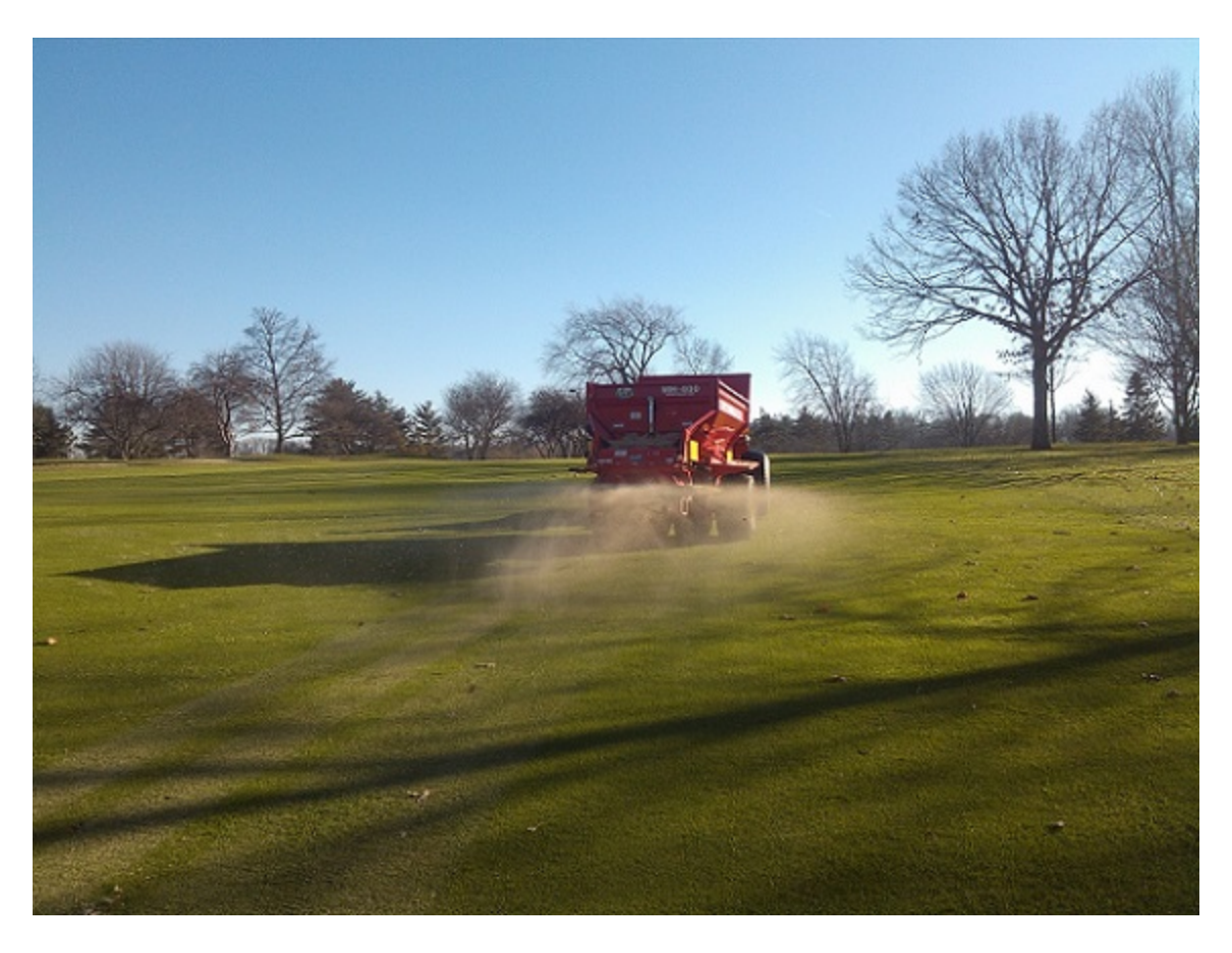
Figure 15. Light sand topdressing on a fairway.