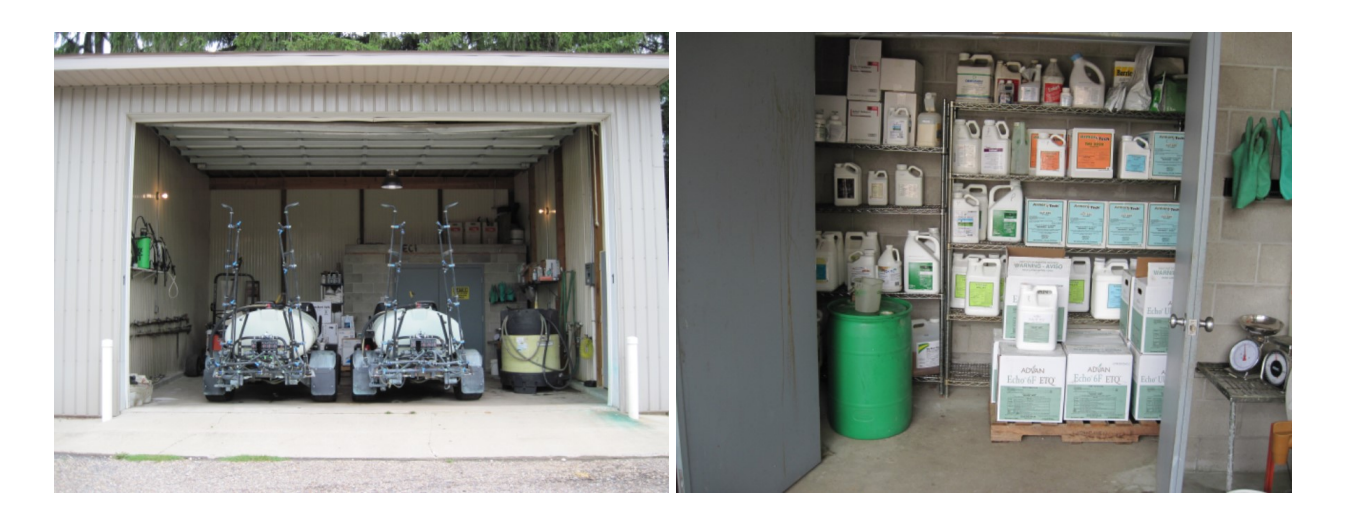
Figure 5. Separate building for storing, mixing and loading plant protectants complete with metal shelving for chemicals in a locked, limited access area, at Elcona Country Club.