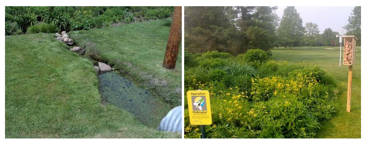
Figures 10 and 11. Vegetative rain garden at Elcona Country Club that traps and filters pollutants and clippings from equipment wash water sources.