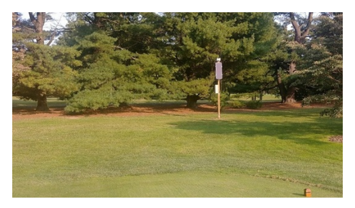
Figure 22. Use of solar panels to power a warning siren at Elcona Country Club.