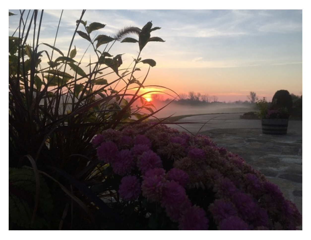
Figure 20. Pollinator plantings along a tee area at Victoria National Golf Club.

native trees, shrubs, and herbaceous vegetation to provide wildlife habitat in non-play areas, along water sources to support fish and other water-dependent species. By leaving dead trees (snags) where they do not pose a hazard, a well-developed understory (brush and young trees), and native grasses, the amount of work needed to prepare a course is reduced while habitat for wildlife survival is maintained.