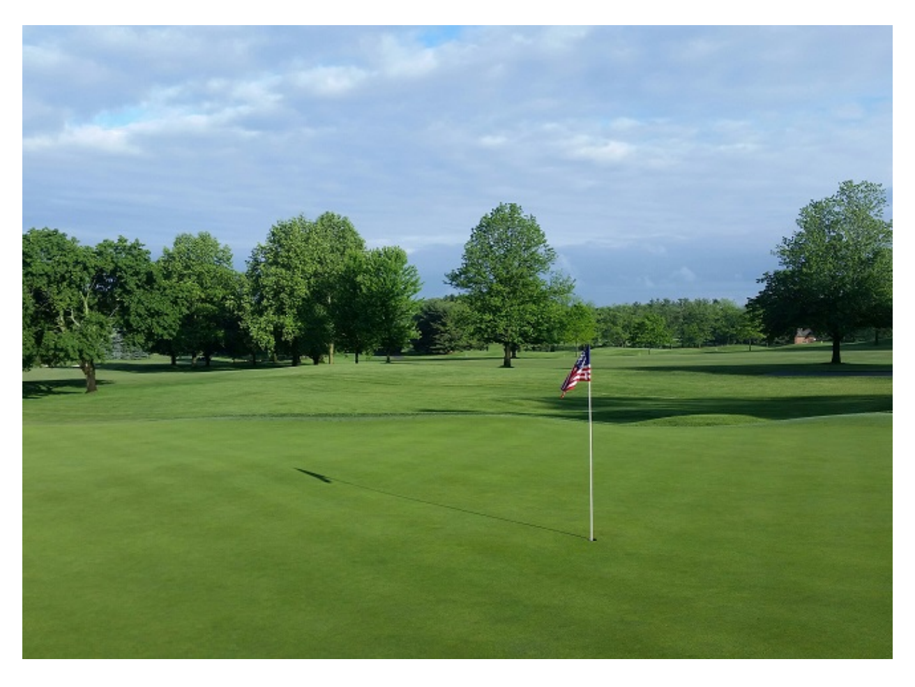
Figure 14. 18 Green at Elcona Country Club.