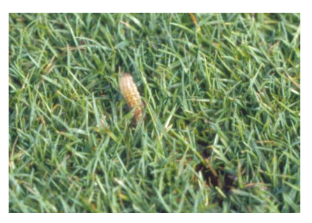
Black cutworm larvae emerging from thatch following a soap flush

NOTE: This method will NOT detect white grubs (chafers, black turfgrass ataenius, Japanese beetle, etc) and will NOT detect the larvae (grubs) of billbugs