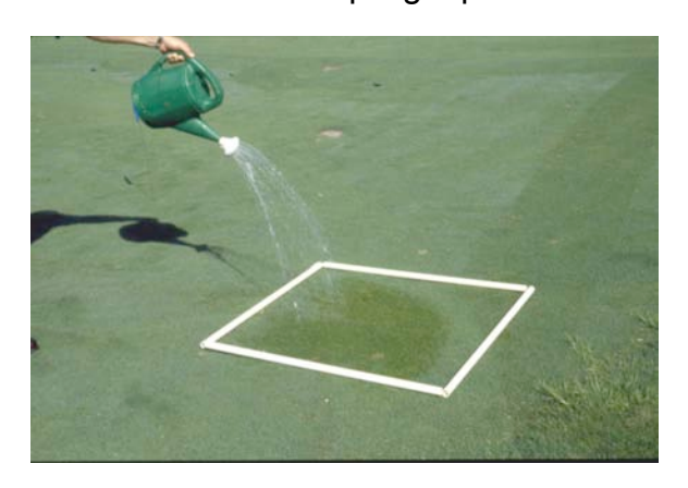
Figure 1. Application of soap solution with a watering can. PVC pipe was used to construct this sampling square.