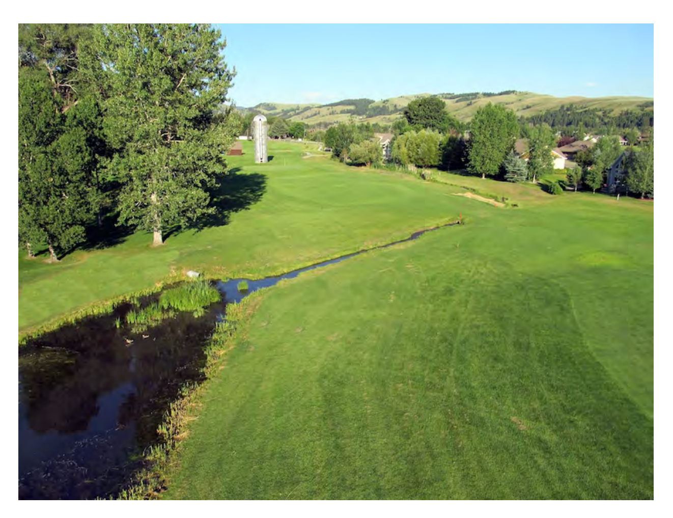
Bridger Creek Golf Course - Bozeman, MT