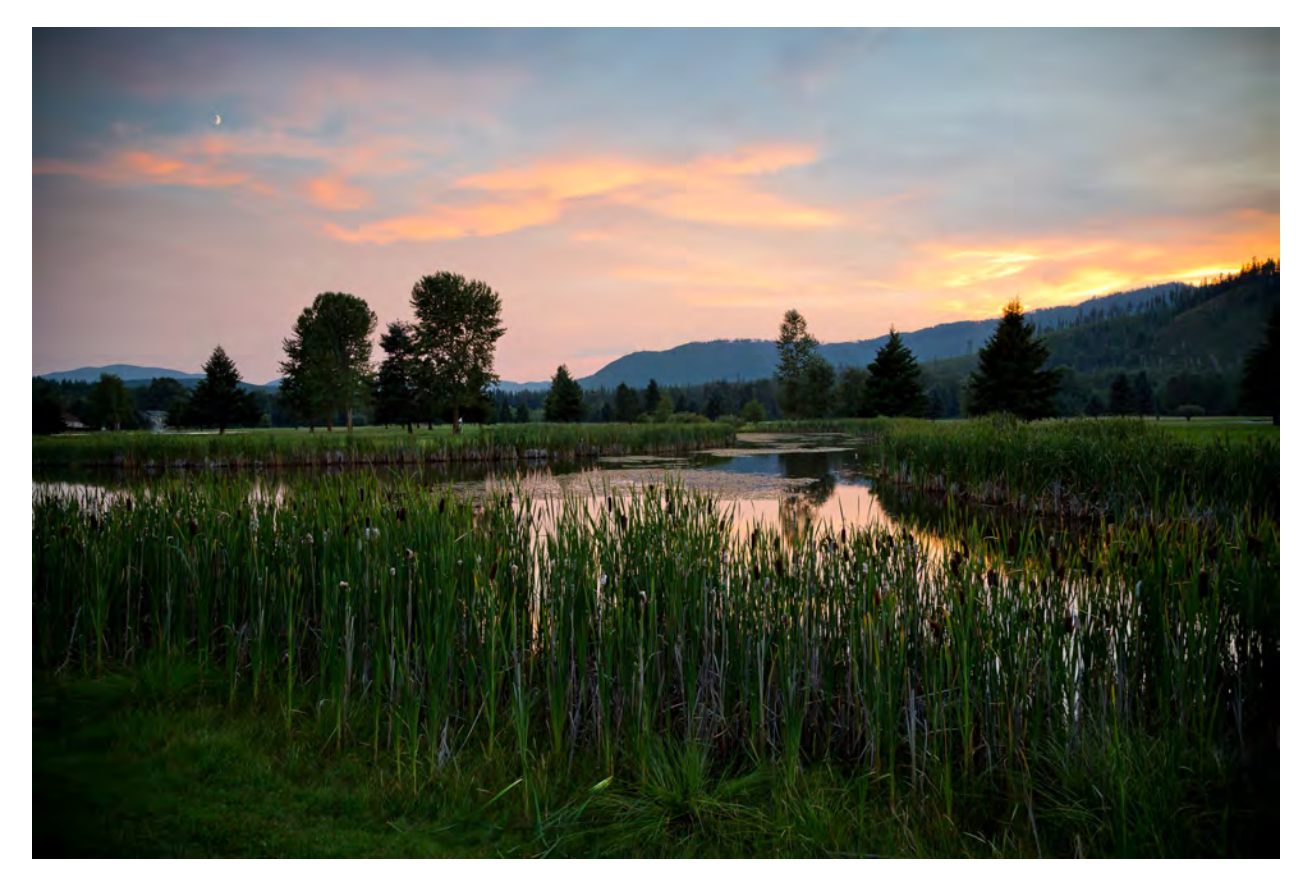
Glacier View Golf Course - West Glacier, MT