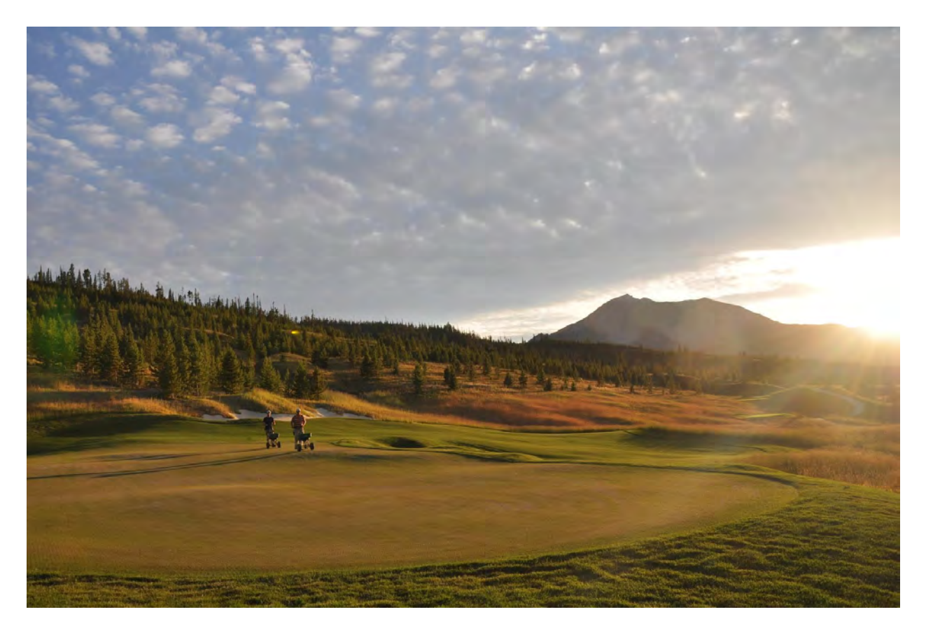
The Reserve at Moonlight Basin - Big Sky, MT