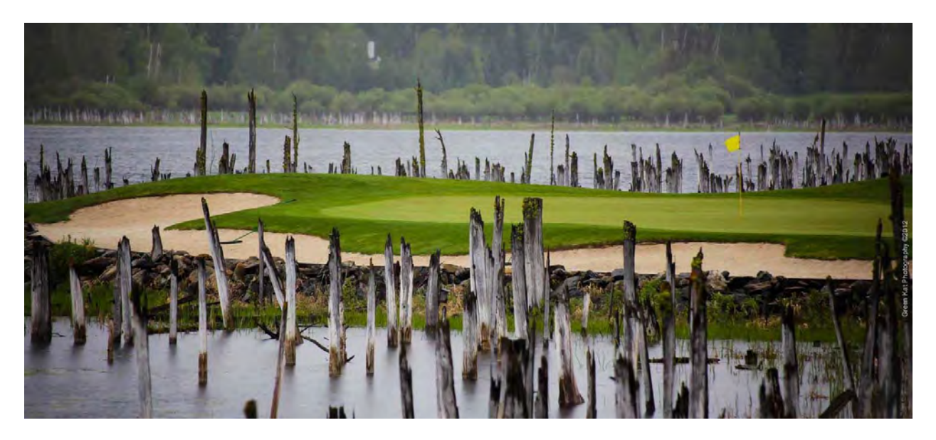
Whitefish Lake Golf Club - Whitefish, MT