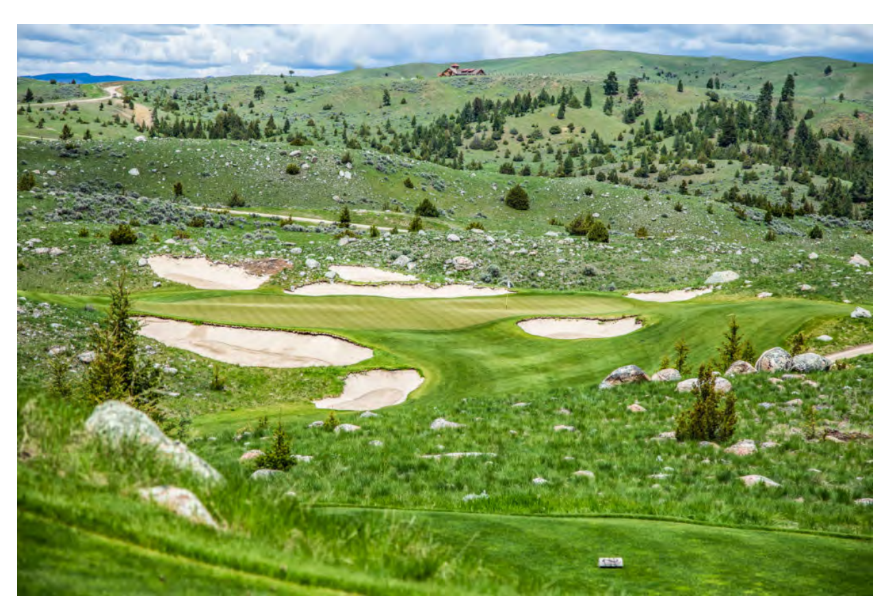
Rock Creek Cattle Company - Deer Lodge, MT

• Add proper soil amendments in garden areas to improve the soil's physical and chemical properties, increase its water-holding capacity, and reduce the leaching of fertilizers.