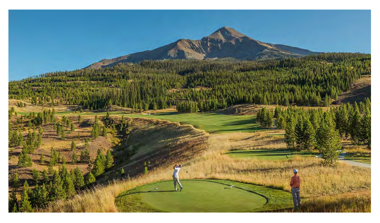
The Reserve at Moonlight Basin - Big Sky, MT