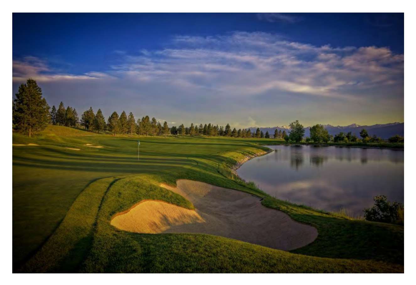
Stock Farm Club - Hamilton, MT