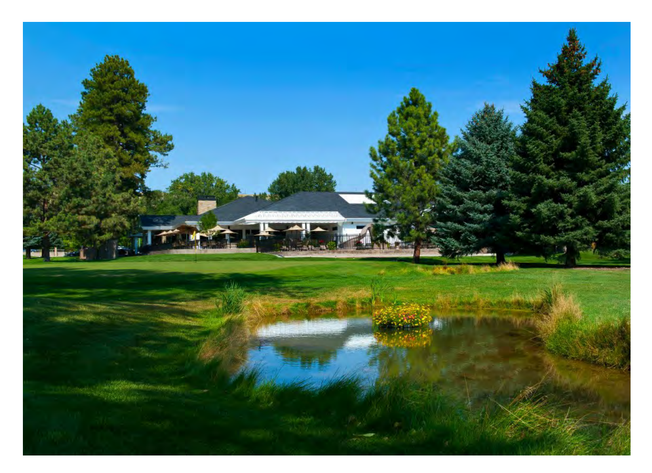
Hilands Golf Club - Billings, MT