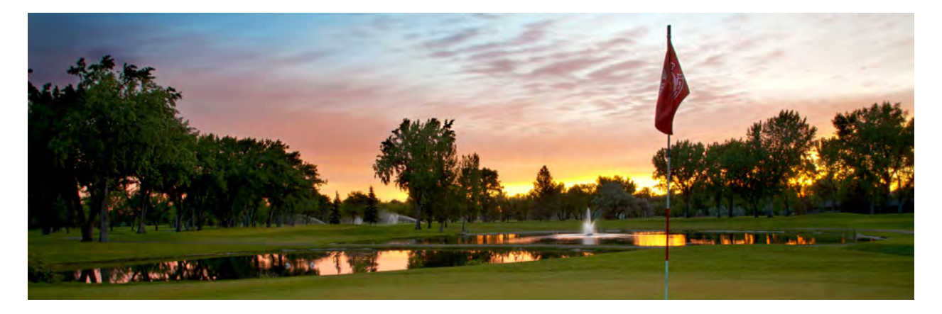
Meadow Lark Country Club - Great Falls, MT