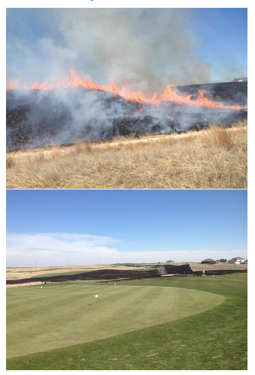
Figure 27. Prescribed burn before (top) and after (bottom) at Wild Horse Golf Course.

As many golf courses convert maintained turfgrass areas to native grassed sanctuaries, many facilities use prescribed or controlled burns to reduce undesirable plants and encourage desirable species, enrich wildlife, and remove excessive plant debris (Figure 27). Prescribed burning is especially effective in suppressing cool-season grasses and woody plant materials to a more desirable stand of a links-style resemblance of a tallgrass prairie. Use of a prescribed burn, along with other control methods, is an IPM approach to effectively manage these eco-sensitive areas. For more information, see <u>Grassland Management With Prescribed Fire</u>, UNL, and <u>Conducting a Prescribed Burn and Prescribed Burning Checklist</u>, UNL.