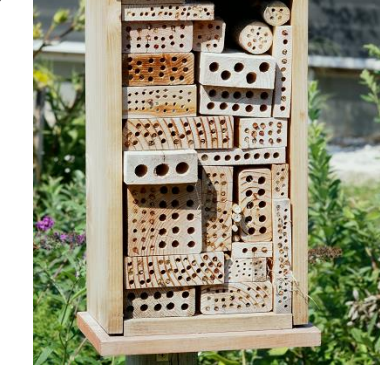
dingFigure 32. Bee habitat the UNL<br/>Backyard Farmer garden.

A clean, reliable source of water is another essential habitat consideration for pollinators. Pollinators can use natural and human-made water features such as running water, pools, ponds, and small containers of water. Water sources should have a shallow or sloping side so the pollinators can easily approach the water without drowning. In addition, irrigation management practices that preserve ground-nesting pollinators include irrigating at night and avoiding flooding any areas.