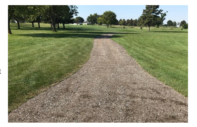
Figure 4. Crushed stone cart path at Ashland Golf Club.

Maximizing the use of pervious pavements, such as brick or concrete pavers separated by sand and planted with grass, allows stormwater to infiltrate into the soil as opposed to running off. Crushed stone and other permeable products are available for cart paths or parking lots (Figure 4). Runoff from gutters and roof drains should flow into permeable areas. <u>Rain gardens</u> near these areas can be incorporated into the landscape design, as discussed in the "Landscape" chapter of this document.