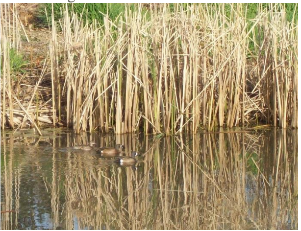
Figure 1. Wetland habitat at Holmes Golf Course.

To protect this natural resource, wetlands should be identified in the field by qualified wetland specialists during the design phase and before the permitting process is initiated. Course design should minimize any impact to wetlands and streams tied to activities such as filling, dredging, flooding, crossings, or converting areas from one habitat type to