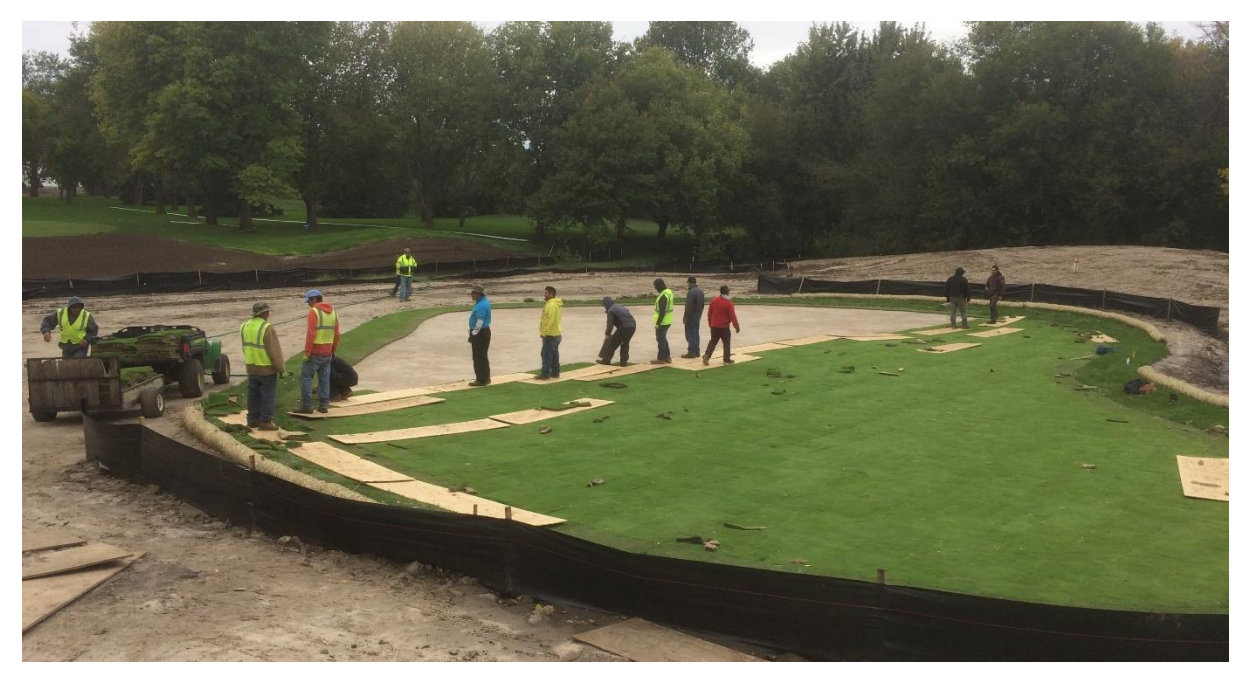
Figure 2. Erosion and sediment control during construction helps to protect water quality from runoff during construction at Oak Hills Country Club.

Source controls are the first car of the BMP treatment train. They help prevent the generation of stormwater runoff or the introduction of pollutants into stormwater runoff. The most effective method of stormwater treatment is to prevent or preclude the possibility of movement of sediment, nutrients, or pesticides in runoff. For example, during construction or redesign, strict adherence to erosion and sedimentation controls helps to prevent, or at least minimize, the possibility for sediment and nutrients to impact water quality through runoff (Figure 2). Once a course is built, the implementation of BMPs is the most effective method of preventing negative impacts from golf course management activities.