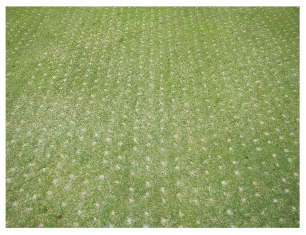
Figure 23. Sand topdressing following aeration.