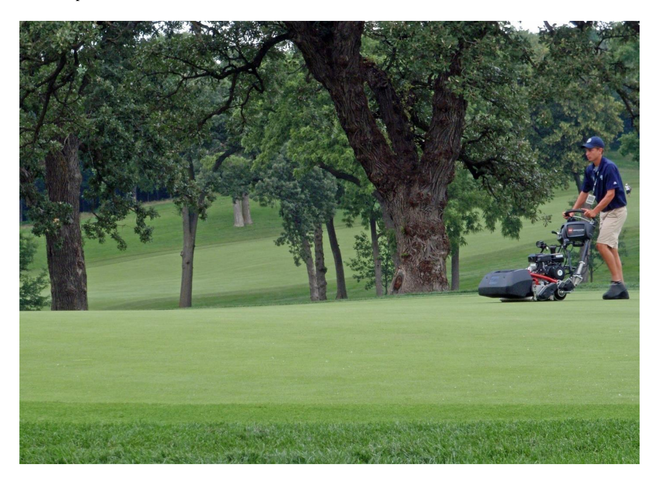
Figure 19. Mowing greens at Omaha Country Club.

Mowing is the most commonly used cultural practice on golf courses. Mowing practices impact turf density, texture, color, root development, and wear tolerance. Failure to mow properly will result in weakened turf with poor density and quality. Mowing height decisions are typically based on the turf species and location on the course. Other factors affect mowing as well, such as frequency, shade, equipment, time of year, root growth, and abiotic and biotic stress. Mowing should increase tillering and shoot density while not decreasing root and rhizome growth as much as possible.