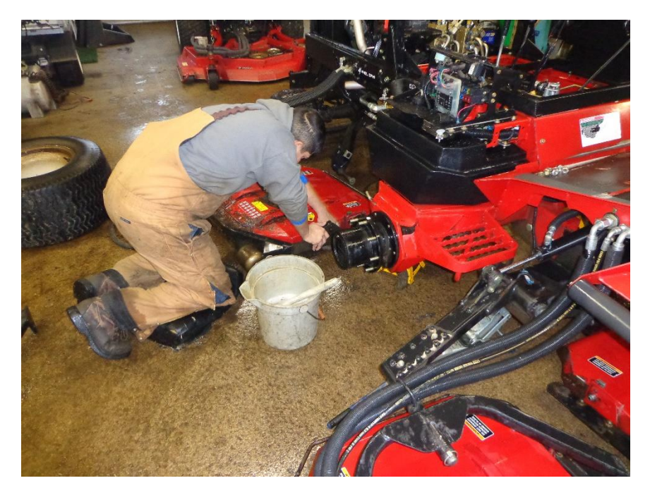
Figure 33. Maintaining equipment extends the useful life of machinery.