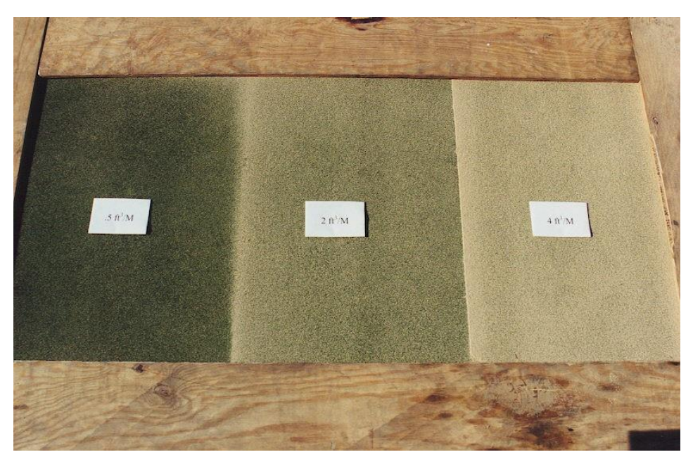
Figure 24. Sand particle application rate differences.