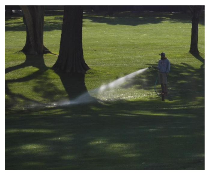
Figure 14. Hand watering at Country Club of Lincoln.

The goal of successful irrigation management is to limit excessive soil moisture while preventing wilt. Golf managers strive to precisely apply water so plant-available water is only slightly greater than predicted ET (Figure 14). For many highly maintained turf areas, like greens,