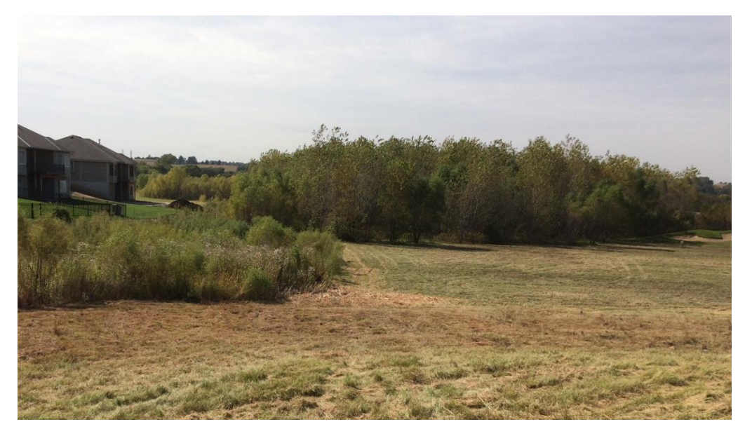
Figure 3. Native grass buffer next to wetland protects water quality at The Players Club in Omaha.

stormwater (e.g. constructed wetlands and wet retention basins), and filter stormwater via vegetative practices (e.g. filter strips and grassed swales) (Figure 3). The treatment train approach combines these non-structural controls with structural controls, as in the following example: Stormwater can be directed across vegetated filter strips, through a swale, and into a retention pond, then out through another swale to a constructed wetland system.