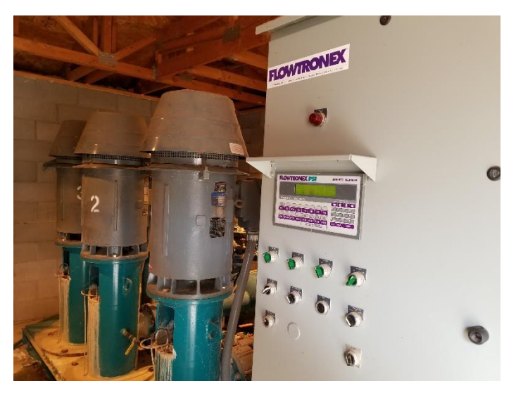
Figure 9. VFD pumping station at Heritage Hills Golf Course.

The irrigation system design should meet the site-specific needs identified by the water quantity analyses and the site assessment. The system's capacity to deliver water should not exceed the infiltration of the soils on site, as that will lead to runoff. Though the design of an irrigation system is complex, some of the most important design decisions that influence the efficiency and effectiveness of water usage include those related to sprinkler and piping placement, sprinkler coverage and spacing, and communication options.