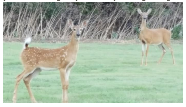
Figure 5. Wildlife at Heritage Hills Golf Course.

In addition to adhering to regulations that protect listed species, maintaining habitat to the extent possible during all phases of planning, design, and construction helps maintain biodiversity.