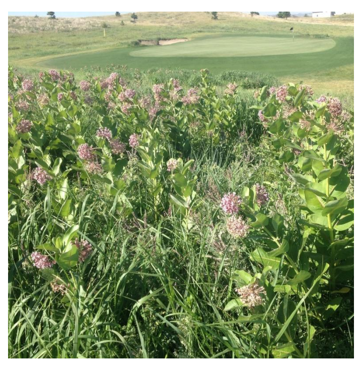
Figure 31. Milkweed provides quality habitat for monarch butterflies at Wild Horse Golf Course.

Habitat for pollinators includes nesting sites, water, and foraging habitat for adults and their young. Pollinator-friendly habitat contains a diversity of plants, including a mix of blooming plants with different bloom colors, heights, and blooming times; grasses that provide habitat and larval food; and trees that provide early season pollen. Though wildflowers are most often thought of as pollinator-friendly plants, grasses such as big bluestem are a major pollen source for native bees in Nebraska. In addition, many sedge species are larval hosts, hollow stem grasses provide nesting habitat, and sturdy grasses shelter insects from harsh weather. Milkweed provides habitat specifically for monarch butterflies (Figure 31).