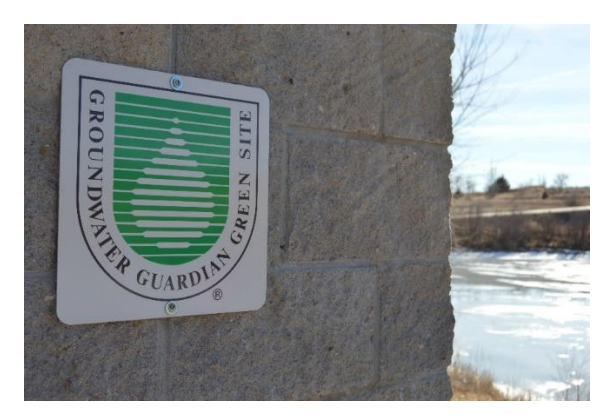
Figure 8. Heritage Hills Golf Course is a Groundwater Guardian Green Site.

Golf courses can gain valuable recognition for their environmental education and certification efforts. Examples of external designations include Audubon International's <u>Cooperative</u> <u>Sanctuary Program</u> and the Groundwater Foundation's <u>Groundwater Guradian Green Site</u> program (Figure 8). The Groundwater Foundation was founded in Nebraska and is headquartered in Lincoln.