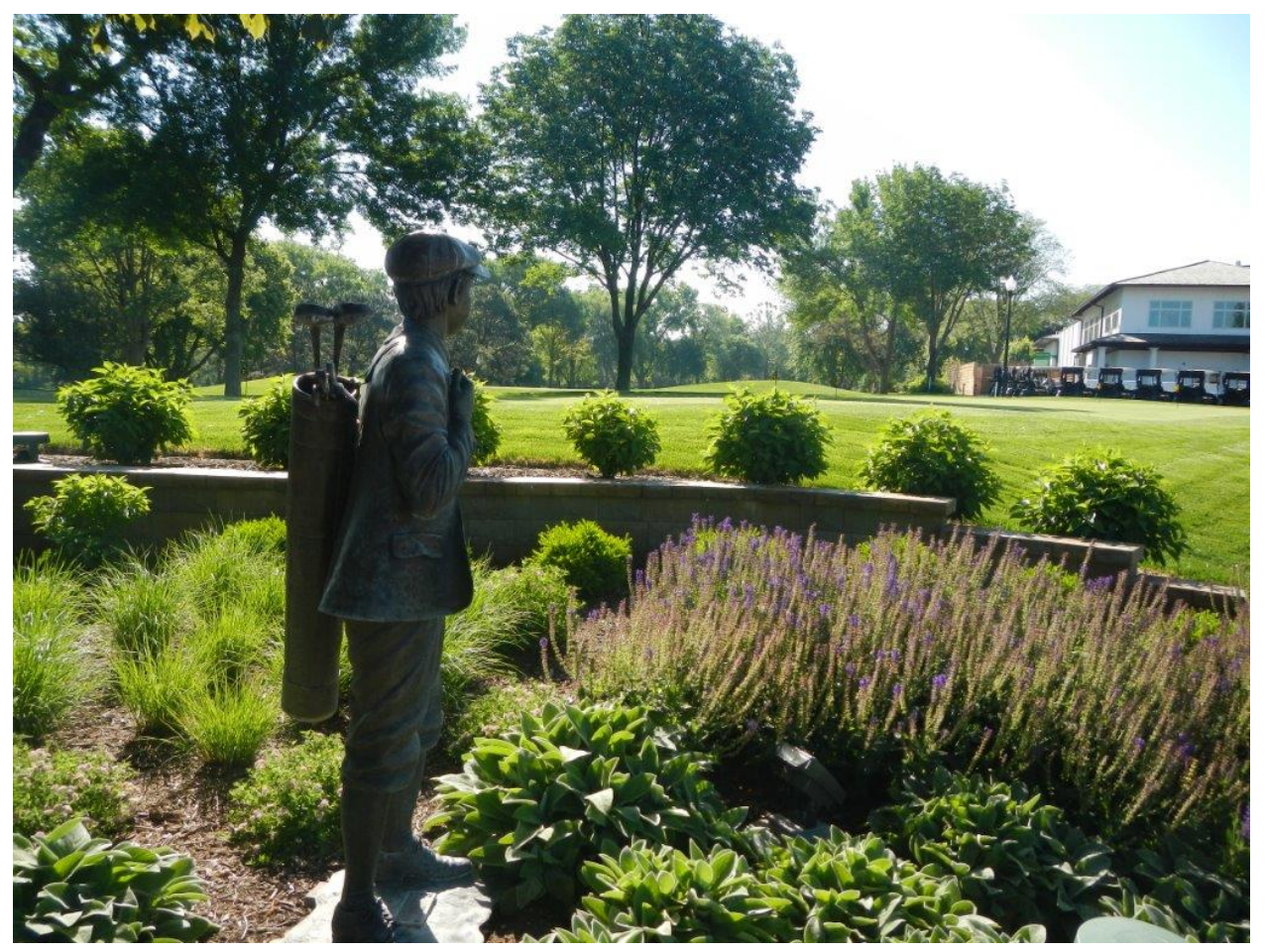
Figure 34. Landscaping at Country Club of Lincoln.

Ideally, 10% or less of the landscaped areas should be zoned for high water use, 30% or less of the area should be zoned for moderate water use, and 60% or more of the landscape should be zoned for low water use.