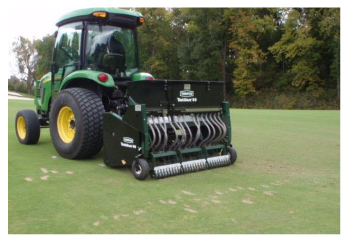
Figure 6. Fairway seeding at Omaha Country Club.

Cool-season turfgrass species (bluegrass, fescues, ryegrass, and bentgrass) should be seeded in late summer. This timing is ideal because soils are warm, nights are cool, and disease and weed pressure are reduced. A drop-type spreader should be used to ensure uniform seed dispersal. Lightly raking the soil or using specialized "slit seeders" improves seed-to-soil contact (Figure 6). Warm-season species like buffalograss and zoysiagrass should be seeded in mid-spring to late spring. All species can also be dormant seeded in late fall through the winter. Cool-season species can be seeded in the spring, especially following winterkill. For any spring seeding, preemergence herbicides vastly improve the success of grow-in. Without a pre-emergence herbicide, spring seeding success is significantly reduced because of the intense summer annual weed pressure across Nebraska. Herbicide labels should be reviewed to ensure that the product is labeled for use during establishment.