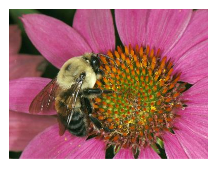
Figure 28. Halictid Bee, Agapostemon, (female).

For general information on protecting pollinators in Nebraska, see: