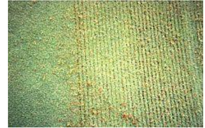
Figure 22. Vertical mowing.

Spiking/slicing reduces surface compaction and promotes water infiltration with minimal surface damage. Slicing is faster than core aeration but is less effective. Spiking can break up crusts on the soil surface, disrupt algae layers, and improve water infiltration.