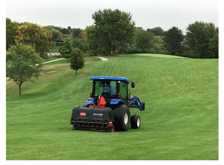
Figure 20. Fairway aeration at Kearney Country Club.

Aeration practices consist of core aeration, deep drilling, solid tining, and high-pressure water injection. Light and frequent sand topdressing applications are also beneficial for smoothing the surface, diluting organic matter, and improving playability.