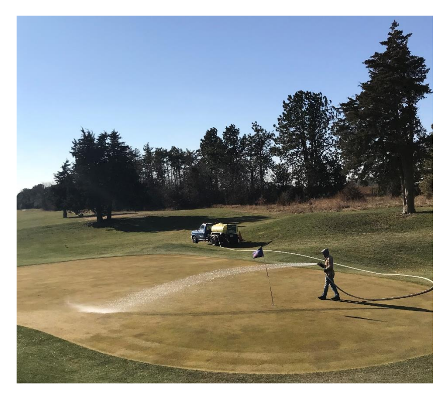
Figure 15. Handwatering at Pioneer Golf Course during the 2017/2018 winter to prevent dessication.

Turf growing on sandy soils and having excessive thatch are more likely to have issues with winter desiccation. Therefore, lightly irrigating high value turf on dry sunny days when the air temperatures are well above freezing is recommended to rehydrate plant crowns back to a survivable level and restore moisture at the surface. Other cultural practices such as sand topdressing, turfgrass covers, snow fences, and desiccants may also help prevent desiccation/winter injury.