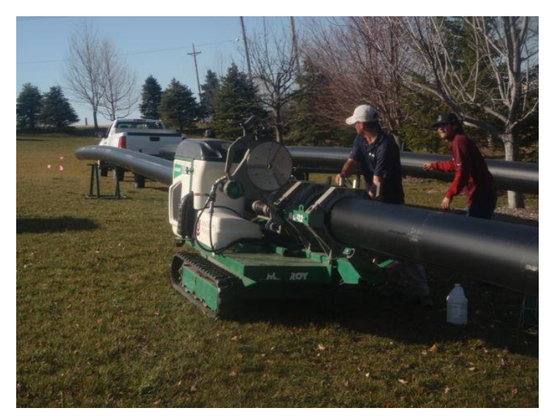
Figure 11. Irrigation installation at Omaha Country Club.

To ensure maximum efficiency, the irrigation system must be installed per the design and specifications. The installer must ensure that there is qualified supervision of the installation process and that a qualified irrigation specialist inspects and approves the system installation.