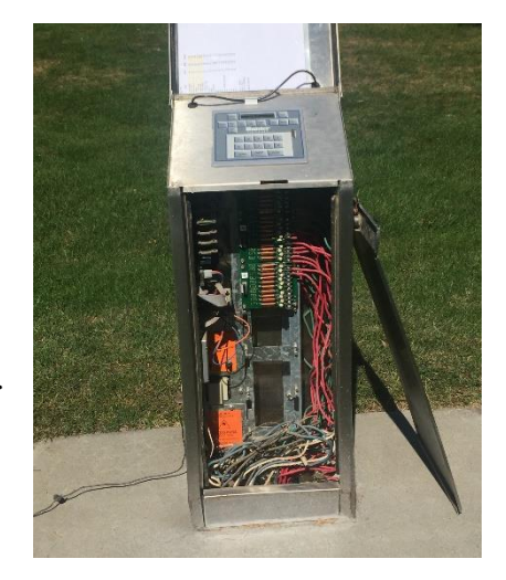
Figure 10. Irrigation satellite station at Holmes Golf Course.

respond to specific moisture requirements of selected areas. Newer designs with multiple nozzle configurations provide increased flexibility and improved distribution uniformity. Single row systems do not uniformly distribute water and increases the risk of runoff. Double-row systems offer an improved efficiency over single-row coverage, although manual watering or other types of supplemental watering may be needed outside the fairway area and into the extended rough. Sprinkler layouts can be specific to each area. For example, part-circle sprinklers can be arranged to avoid overspray of impervious surfaces, to apply water only to the green surface, or in heavy traffic areas. Manual quick-coupler valves can be an important conservation element and should be installed near greens, tees, and bunkers so these can be hand-watered during severe droughts. Irrigation systems strive to provide uniform water distribution and to achieve distribution uniformity (DU)