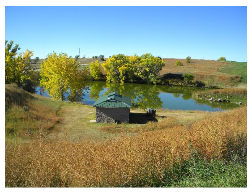
Figure 16. Vegetation around the irrigation pond at Heritage Hills Golf Course.

Vegetation is an important part of the stormwater treatment train concept of stormwater management, often utilized before stormwater enters another treatment device, such as a wet, dry, or infiltration basin. Vegetation reduces stormwater flow velocity, allowing it to infiltrate into the soil and settle particulates, as well as to prevent erosion. Such use of vegetation occurs in filter strips, grassed swales, and riparian areas (Figure 16).