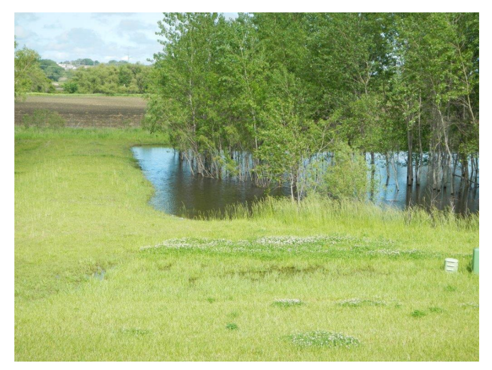
Figure 17. Wetlands at The Players Club.

quality, and low/no maintenance activities to avoid nutrient or pesticide contamination (Figure 17).