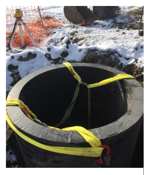
Figure 18. New well installation at Pioneers Golf Course.

Before installing new wells, the appropriate NRD should be contacted to determine the permitting and any setback requirements. New wells should be located up-gradient as far as possible from potential pollutant sources, such as petroleum storage tanks, septic tanks, chemical mixing areas, and fertilizer storage facilities. Most pesticide labels now prohibit mixing/loading pesticides within 50 feet (or