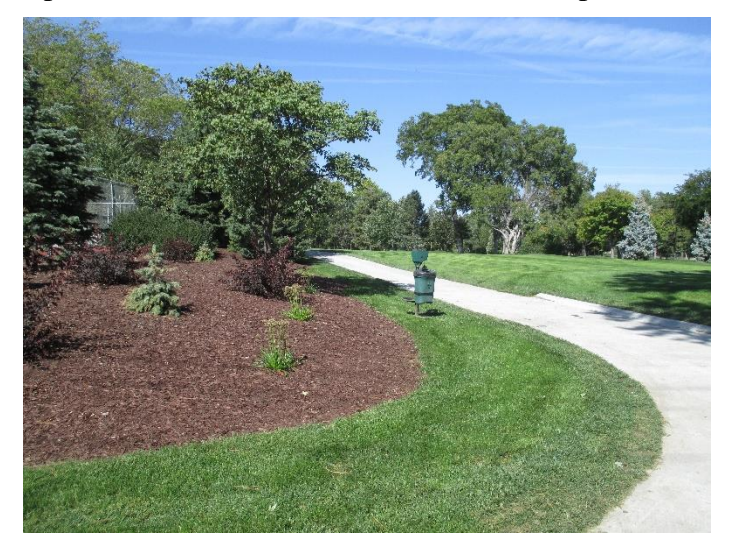
Figure 36. Mulching conserves soil moisture and reduces weed competition.

Annuals and perennials grow best with no more than 2 inches of mulch; mulch around trees and shrubs should be no more than 3-4" deep. With any planting, mulch should be placed between the plants and not on top of the crown or