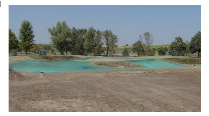
Figure 7. Hydro mulching at Indian Creek Golf Course.

Of the three options for establishing turf -seeding, sodding, and plugging -- the first two are currently the most-used methods in Nebraska. Hydro seeding and hydro mulching also help prevent erosion and speed establishment (Figure 7).