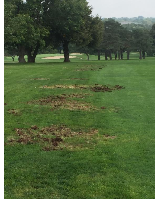
Figure 26. Grub damage can be significant.

White grubs can destroy significant areas of turfgrass, with damage appearing in the later part of summer (mid-August through early September). Summer drought stress and insufficient irrigation may compound the damage to turf by grubs. Additional information on their biology and scouting methods is available on UNL's <u>White Grub Management</u> page.