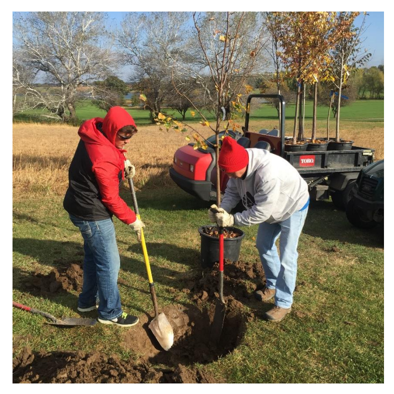
Figure 35. Planting trees at Holmes Golf Course.

plants a better chance to establish good root systems. Additional guidelines for <u>planting and</u> <u>establishing trees in Nebraska</u> are published by ReTree Nebraska and in <u>Tree-Planting for</u> <u>Success</u>, Nebraska Statewide Arboretum.