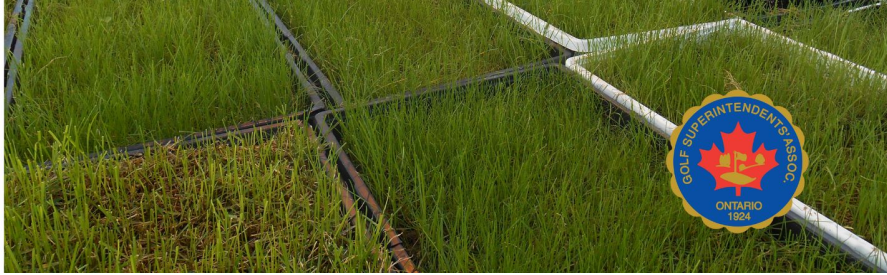
In the greenhouse. OGSA image. ONCourse, August 2017, pg. 23.

Proper nutrient management plays a key role in minimizing potential impact to the environment, while at the same time having the potential to increases course profitability. Among other benefits, applied nutrients increase the available pool of nutrients and allow turfgrass to recover from damage, increase its resistance to stress, and increase its playability and aesthetics. One of the major concerns of excess fertilization is nitrogen and phosphorous migration through surface runoff and the potential risk of negative environmental impact. Nutrients may move beyond the turfgrass via leaching or runoff, which may directly impact our environment, and the impacts of nitrogen and phosphorus management on water quality has been well documented with solutions widely discussed throughout the golf industry. The goal of a proper nutrient management plan should be to apply the minimum necessary nutrients to achieve an acceptable playing surface and apply these nutrients in a manner that maximizes plant uptake and minimizes potential environmental impact. A property designed nutrient management program should incorporate the 4R concept: Right Fertilizer, at the Right Rate, at the Right Time and in the Right Place.