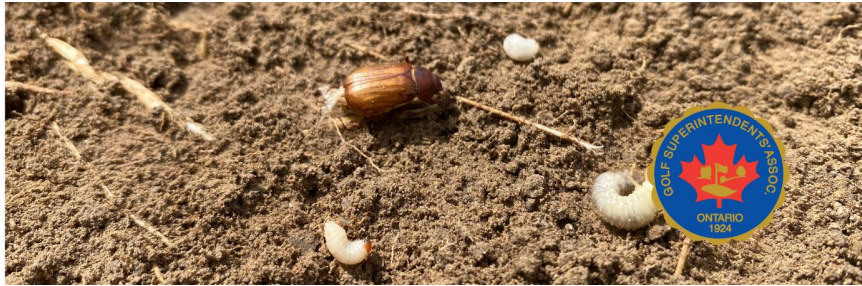
European Chafer.

The philosophy of Integrated Pest Management (IPM) was developed during 1950s because of concerns over increased pesticide use, environmental contamination, and the development of pesticide resistance. The objectives of IPM include reducing the risk of pesticide exposure to people, animals, and the environment, reducing pest management expenses, and conserving energy. Its main goal, however, is to reduce pesticide use by using a combination of tactics to control pests, including cultural, biological, genetic, and chemical controls.