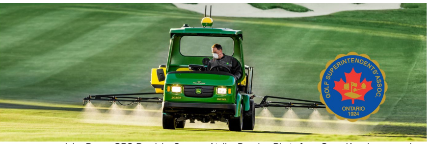
John-Deere-GPS-PrecisionSprayer-Atelier Busche.

Pesticide use should be part of an overall pest management strategy that includes biological controls, cultural methods, pest monitoring, and other applicable practices, referred altogether as integrated pest management (IPM). When a pesticide application is deemed necessary, its selection should be based on control efficacy against the target species, toxicity to non-target species, cost, site characteristics, and its solubility and persistence in the environment.