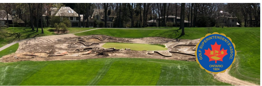
St. George's bunker construction. OGSA image. ONCourse, August 2019, pg. 22.

The construction phase of any industry's infrastructure poses the greatest risk of ecosystem alteration and potential negative environmental impact; and projects within the golf industry are no exception. With proper planning and design new golf course development projects and golf course renovation projects can be constructed and maintained with minimal impact to the existing environment, and also designed and constructed to maximize long term environmental sustainability and energy efficiency.