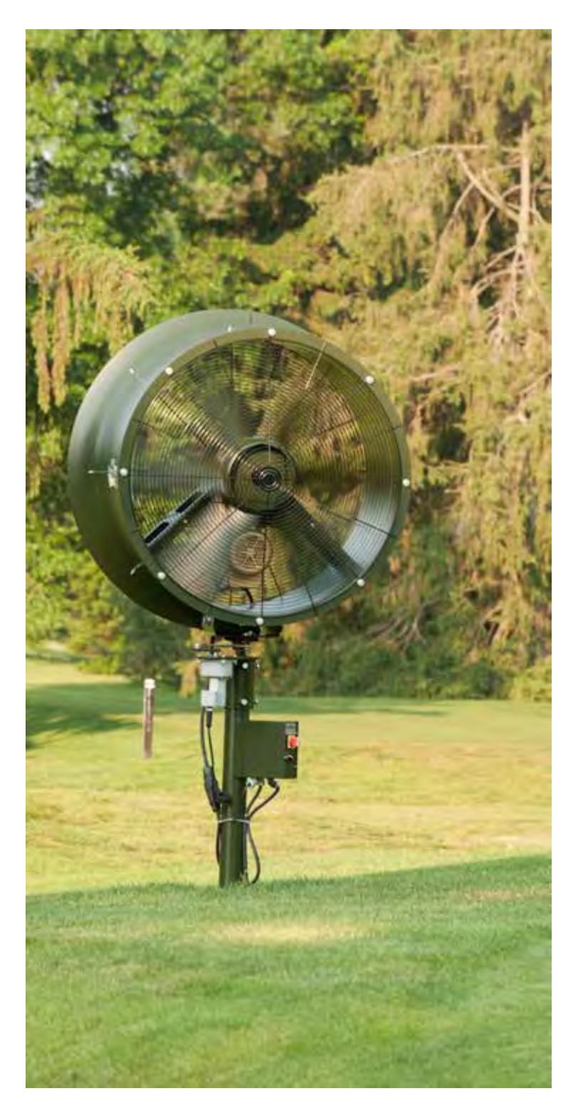
Design and Renovation