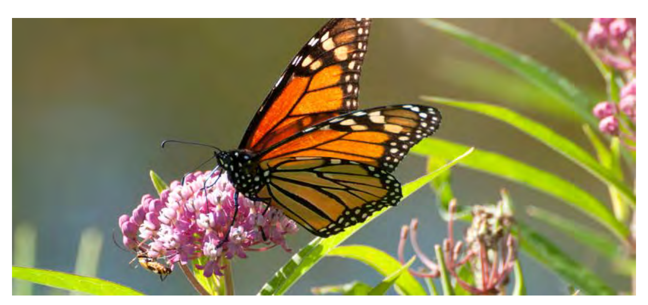
Pollinator Habitat Protection