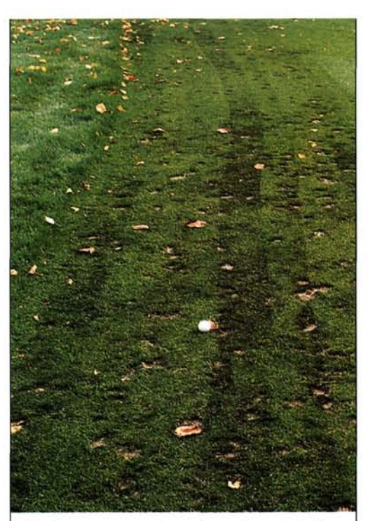
Earthworm casts and mowing equipment don't always mix well together. The result can smother the nearby turf, resulting in poor playing conditions.

The earthworm species depositing casts throughout the Pacific Northwest and much of the northern United States is Lumbricus terrestris , the common