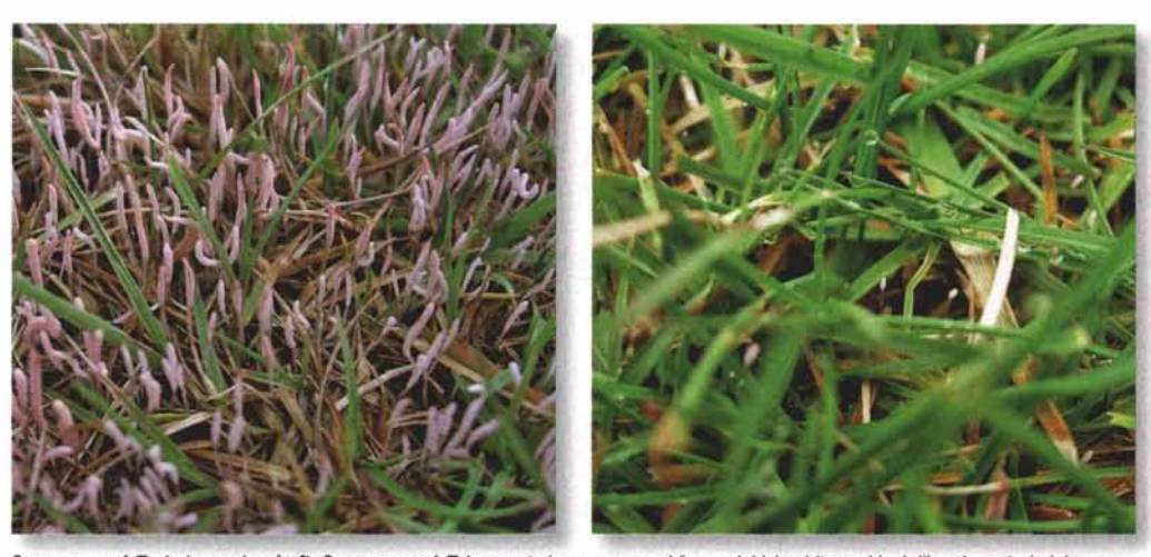
Sporocarps of Typhula species. Left: Sporocarps of T. incarnata (gray snow mold) are pinkish white and look like elongated clubs. Right: Sporocarps of T. ishikariensis (speckled snow mold) are smaller and white.