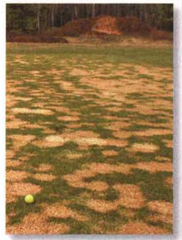
Snow mold damage on the creeping bentgrass practice green at Gateway GC in Land O' Lakes, Wisconsin.