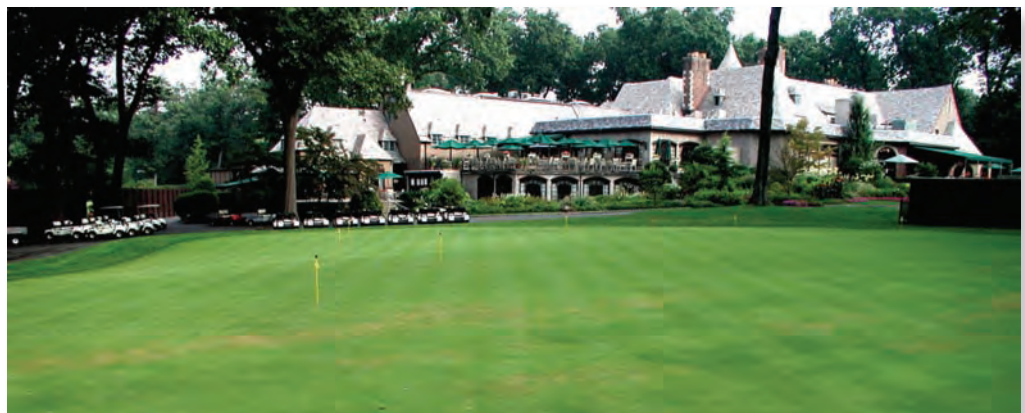
Anthracnose on the annual bluegrass putting green at Ridgewood CC, Paramus, N.J.

This research was funded in part by grants from the Environmental Institute for Golf and the USGA.