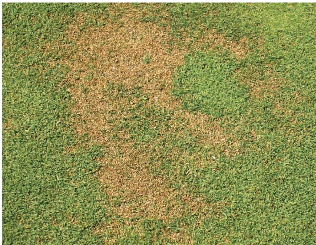
Anthracnose symptoms on annual bluegrass putting green turf.

Even though C. cereale infects a wide range of cool-season grasses, DNA fingerprint analysis of the fungus collected from cool-season grasses in the United States, Canada, Japan, Australia and Europe has shown that individuals from different host plants are members of 11 distinct population groups (7). These populations are predominantly