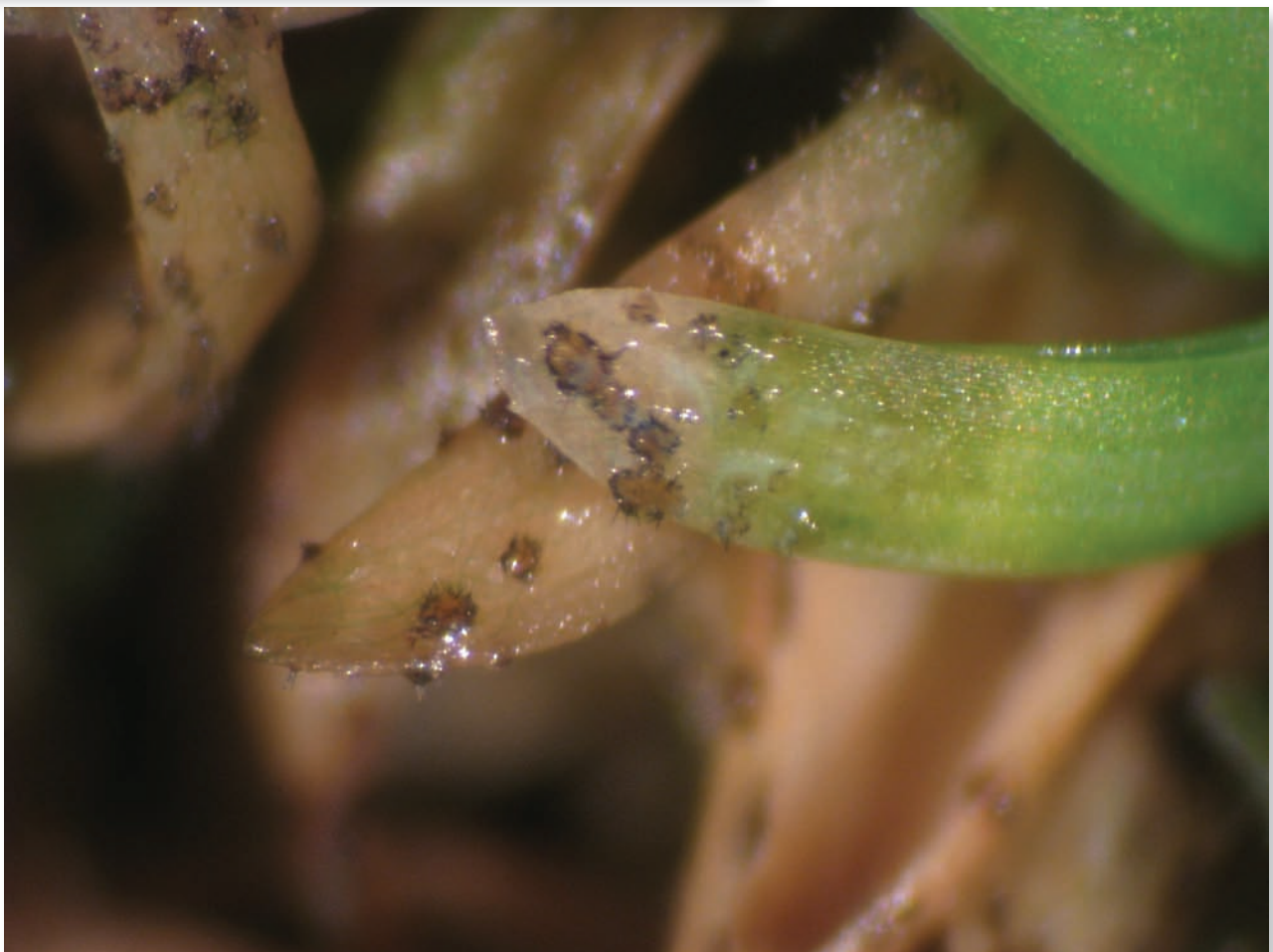
Top: Anthracnose on centipede grass turfgrass.

Anthracnose in warm-season turfgrass is less common and less destructive than the disease that affects annual bluegrass and creeping bentgrass. Consequently, anthracnose has been poorly studied in warm-season turfgrasses. Recent DNA research has shown that anthracnose of warm-season turfgrasses is not caused by the same species of Colletotrichum that is responsible for disease in cool-season