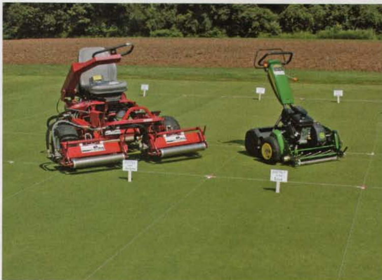
Lightweight vibratory rolling (left) and mowing practices (right) were tested to determine their effect on anthracnose and putting green speed.

some research studies but had no effect in others (8). The effect of lightweight rolling on anthracnose is unknown, although it may enhance disease severity (9).