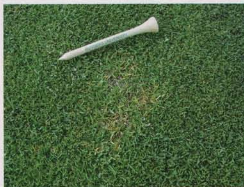
Anthracnose generally begins as 0.25- to 0.50-inch chlorotic (yellow) patches that coalesce to affect larger areas of turf.