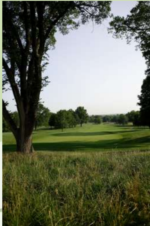
Vertical vs. Horizontal