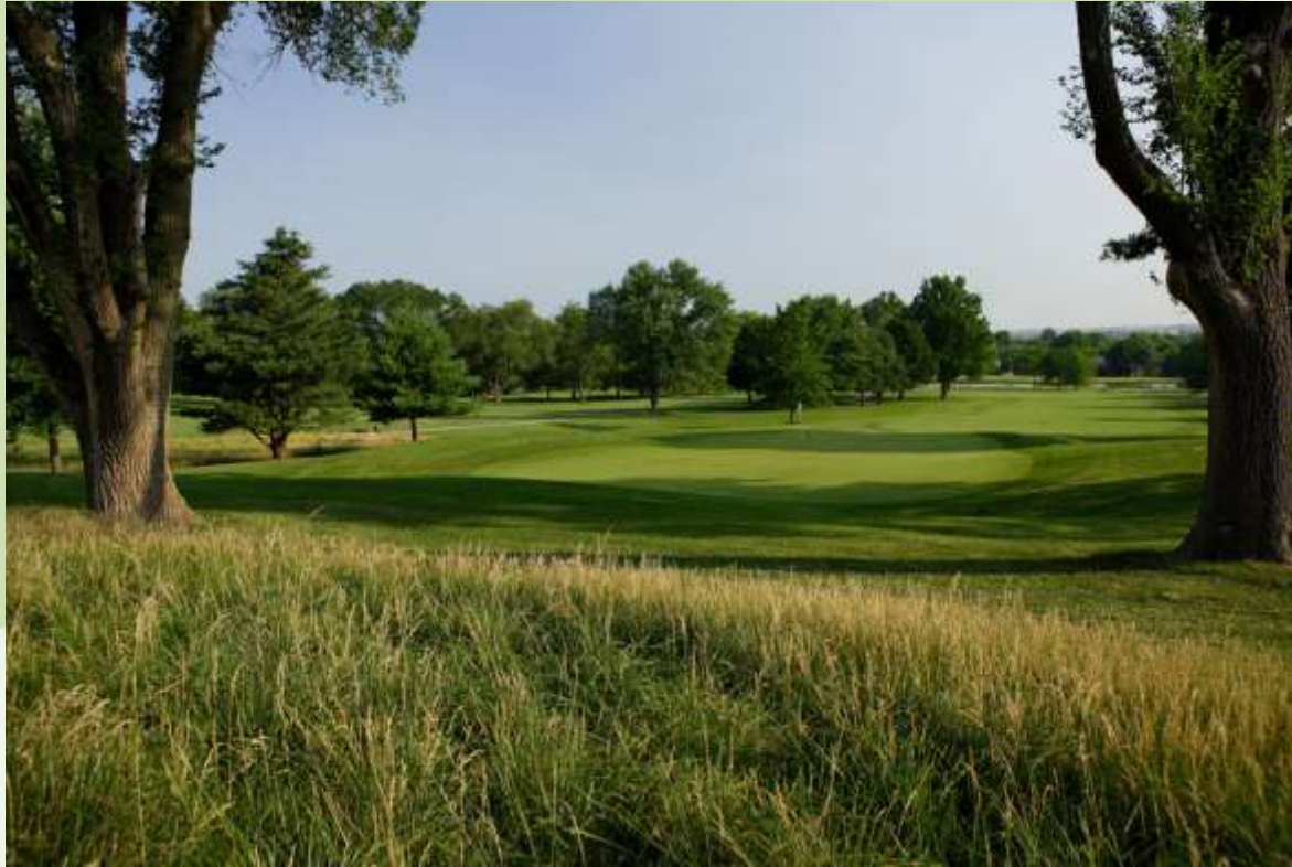
Vertical vs. Horizontal