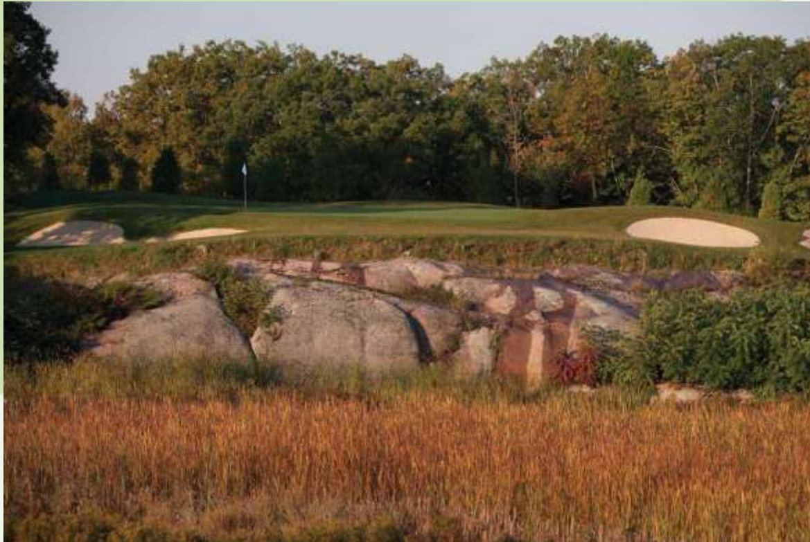
Sun Directly Behind Camera