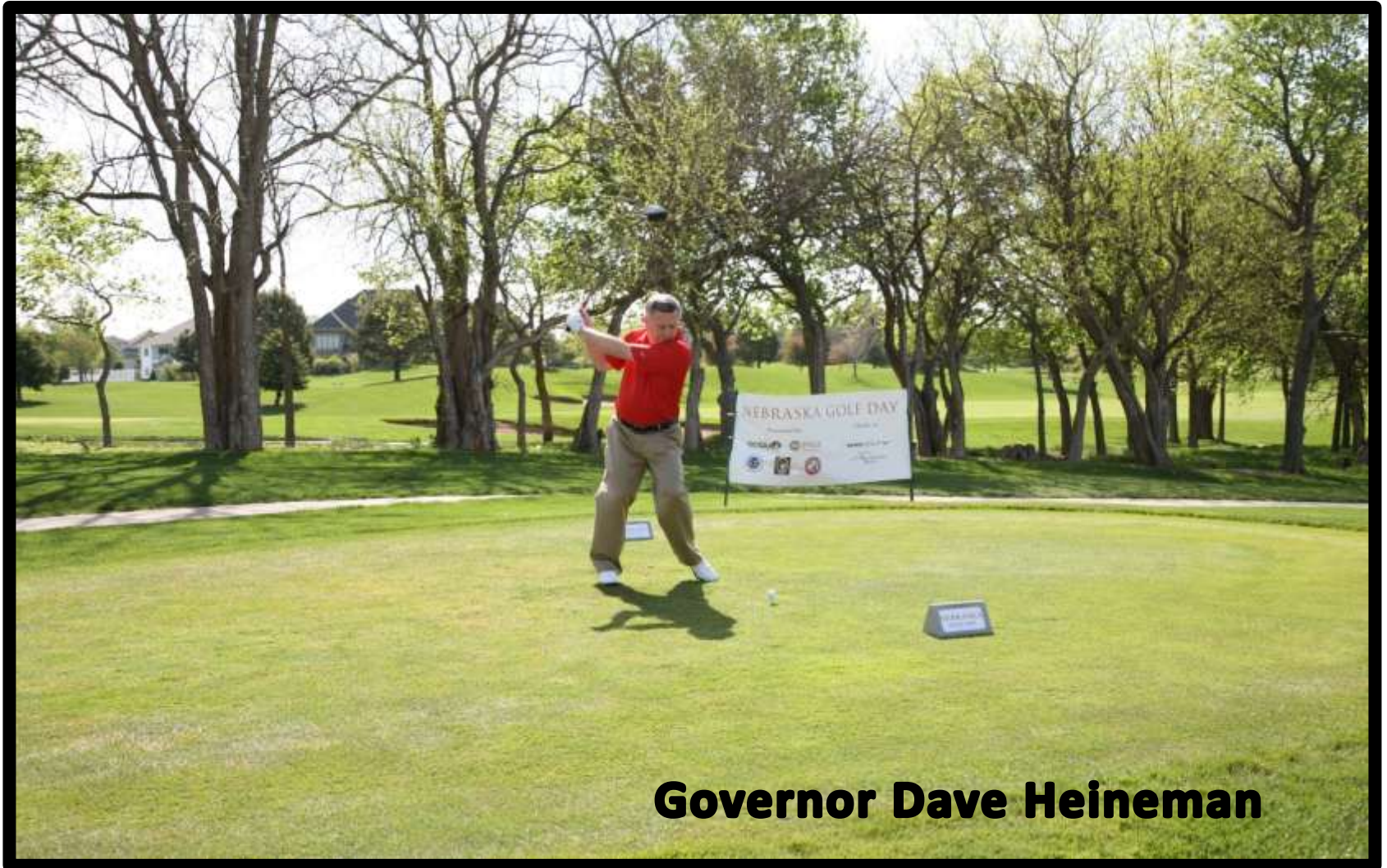
Governor Dave Heineman