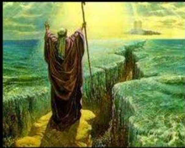
What the Members want me to do