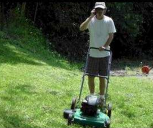
What the Golf Pro thinks I do