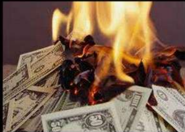
What the owner thinks I do