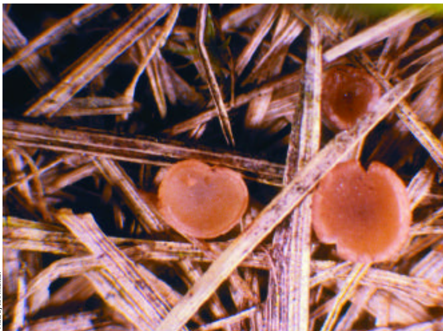
Apothecia of Myriosclerotinia borealis disseminate snow scald by producing massive numbers of ascospores, which are dispersed by wind.

Where Coprinus snow mold is active, receding snow reveals the presence of circu-