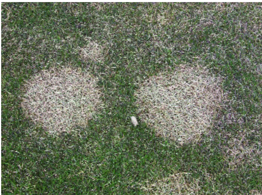
Typical pink snow mold patches were found at Fairbanks (Alaska) G&CC.

Typhula spp. survive as sclerotia during the summer. In late autumn, the sclerotia become exposed to wet, cool (optimum of 40-54 F) conditions that favor germination. Typhula spp. grow very well at temperatures