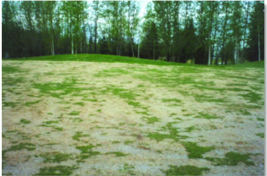
Snow mold patches on Agrostis palustris were caused by Coprinus psychromobidus at Chena Bend GC, Fairbanks, Alaska.

On turfgrasses, the most important snow mold fungi are Typhula incarnata , T. ishikariensis , Microdochium nivale (= Fusarium nivale ), Coprinus psychromobidus , sterile low-temperature basidiomycetes (LTB), Myriosclerotinia borealis and