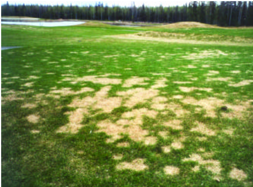
Snow mold on perennial ryegrass ( Lolium perenne ) was caused by Myriosclerotinia borealis and Microdochium nivale at Fairbanks (Alaska) G&CC, the northernmost golf course in the United States.